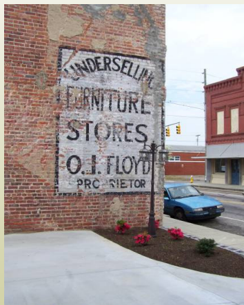
The O.I. Floyd advertisement was uncovered when the theater was demolished in 2006. It still remains as a tribute to Fairmont's heritage.