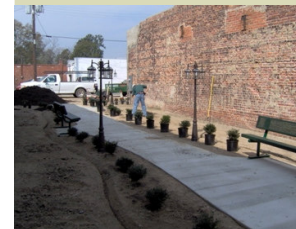
Landscape South plants shrubbery in the park.

Fairmont is a town of 2,800 citizens, and the generosity exhibited for this project exhibits a high proportion of both the business and residential communities’ interest and involvement.